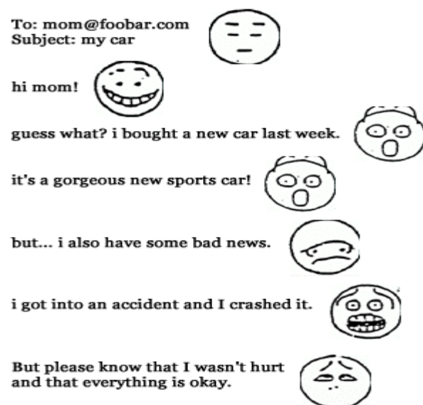
Figure 2: User Scenario

Let us walk through a scenario in which the user writes an email to her mom telling her that she bought a new car but uneventfully wrecked it. Thankfully though, she was not hurt. Figure 2 gives a walkthrough of this scenario. This is a useful scenario because it highlights some of the more advanced behavior of the affect sensing engine.